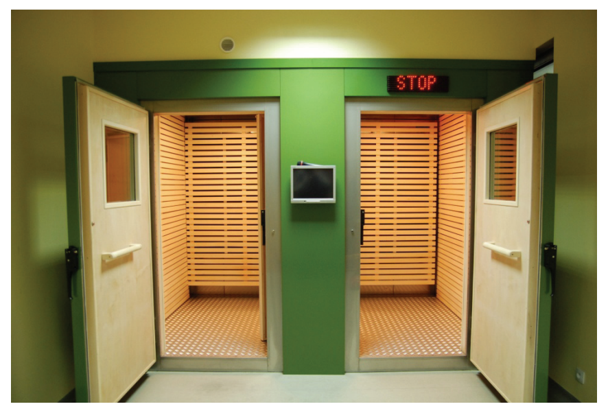
Fig. 4. Two stage cryochamber (KRIOSYSTEM Sp. z o.o. Poland)