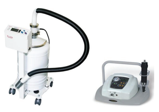
Fig. 1. Examples of stationary and portable cryotherapy apparatus

In some cases, excessive hyperaemia may worsen pain in the long-term (with a strong inflammatory component). In this case cold therapy instead of cryotherapy is recommended.