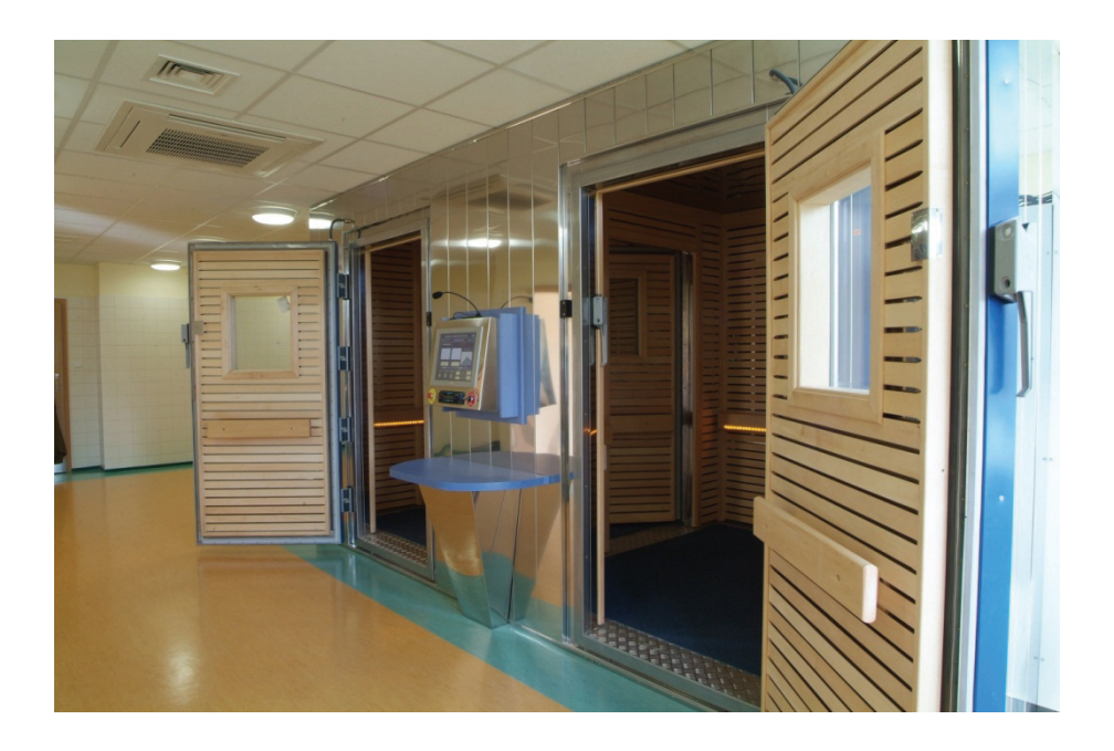
Fig. 3. Two stage cryochamber (CREATOR Sp. z o.o., Poland)